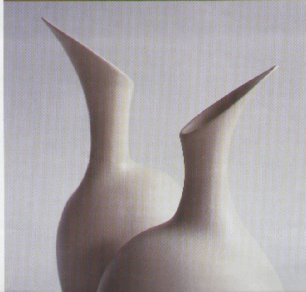
Opposite page: White side spouted winged form, 33cm/h. This page: Top: Detail, group of tall necked white vases, 38cm/h. Centre: White winged form, 25cm/h and Black winged form, 21.5cm/h. Bottom: Detail, Two white side spout forms, 23cm/h.